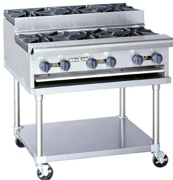
SUHP-36-6 Shown with optional stand and casters